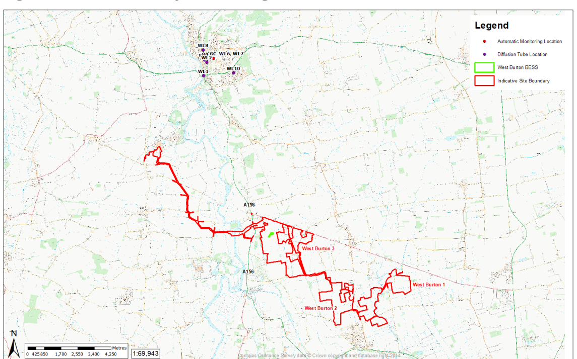
Figure 17.1 West Lindsey Monitoring Locations

17.5.8 As indicated in Table 17.5 , all diffusion tubes located within the Air Quality Assessment area monitored annual average NO_2 concentrations below the AQO for NO_2 (40 µg/m<sup>3</sup> annual mean) during 2019.